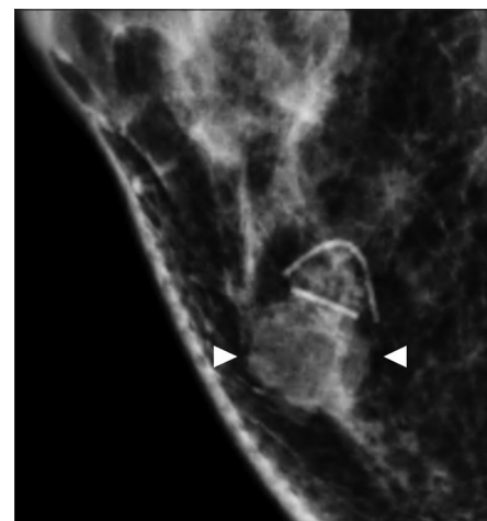
Figure 2: On craniocaudal view of full-field digital mammography, a 1.5 cm irregular isodensity mass with obscured margin is noted at the posterior lower inner region of the right breast (arrowheads)